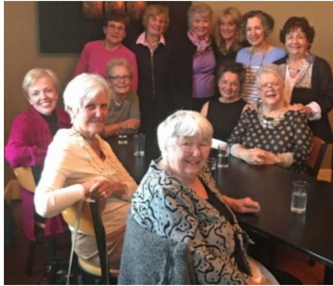
Dinner at Elixir after the play at Northern Stage