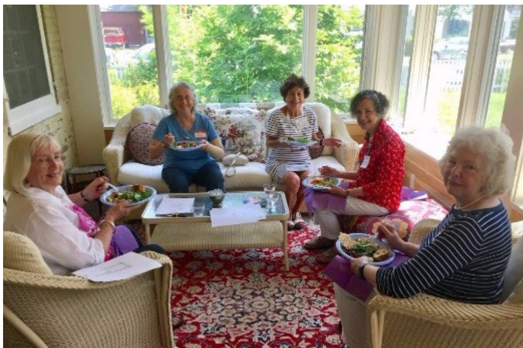
Annual Meeting luncheon was held on June 13th at the Partridge House B & B with 65 members and community guests in attendance.